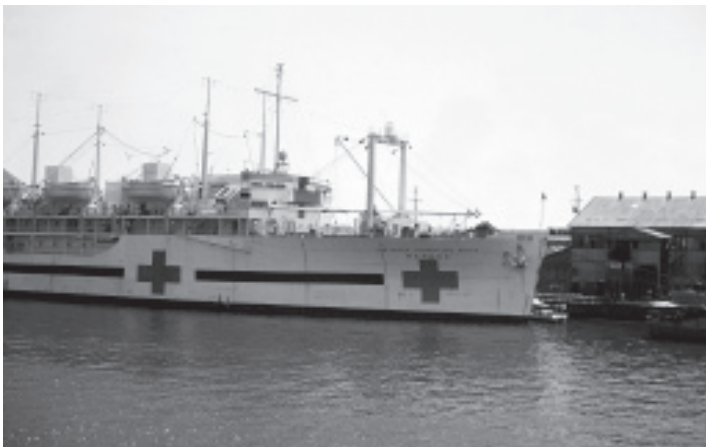
US Navy Hospital Ship Repose at the dock in Korea.