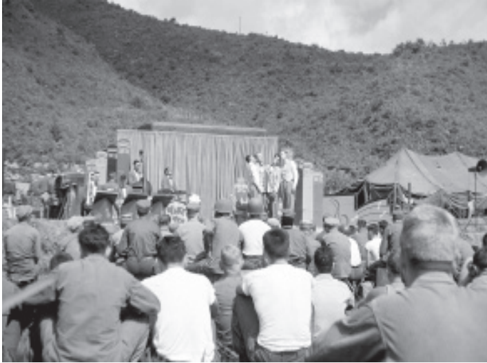
Take Ten, a USO troupe, performs near the front.