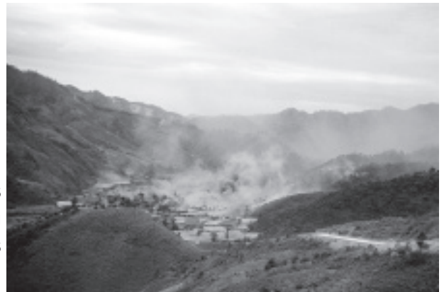
The live rounds hitting the terrain in front of Benny's position.