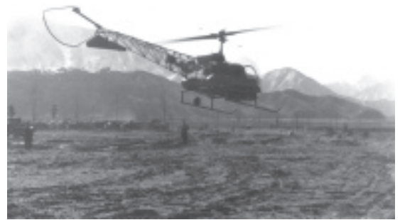
An OH-13 helicopter taking off from a rear area LZ.