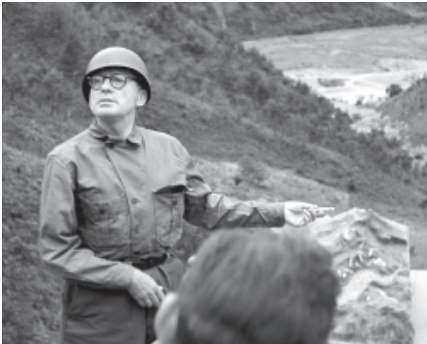
Jack Benny visited the unit and "briefed" a live fire exercise.