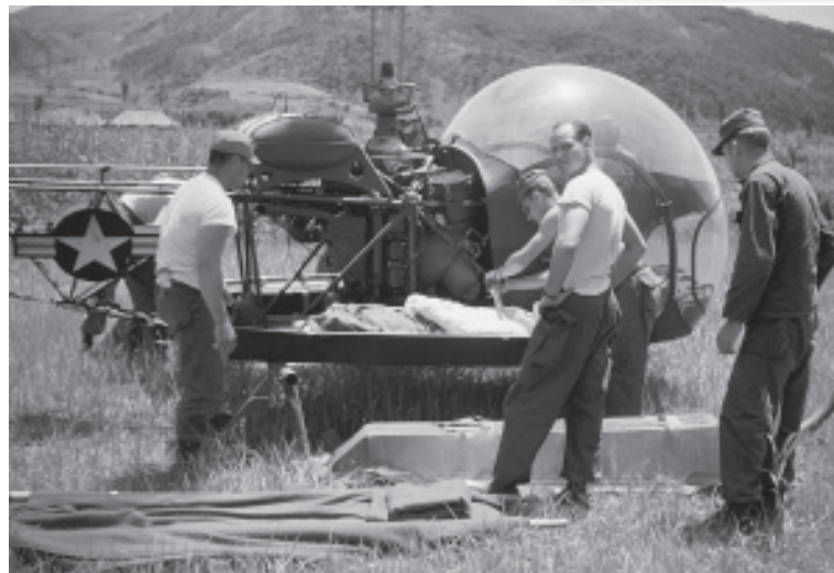
Patient being loaded/unloaded on to the litter of an OH-13 helicopter, evidently not in an area under enemy fire.