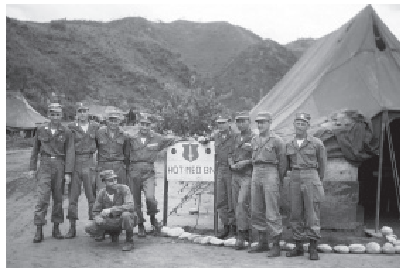
Some of the Medical Bn’s staff.