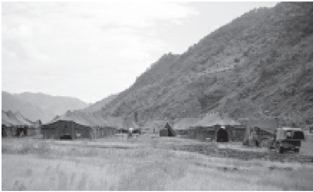
7 th Medical Company's area.