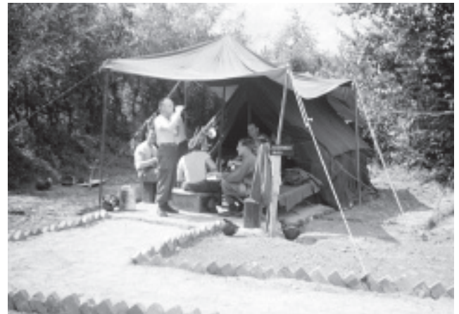
Socializing by the Bn Commander's tent.