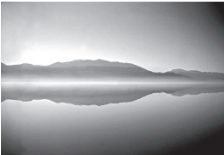
A Korean mountain reflected in a lake...it's blue when seen in color.