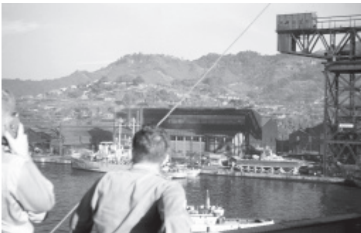
USS PCE(C)-898 (Control Patrol Craft Escort) tied up at the dock in a Korean port. It was later renamed Okpo, and transferred to the ROK Navy.